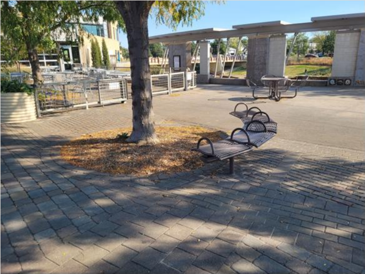
Bench around tree