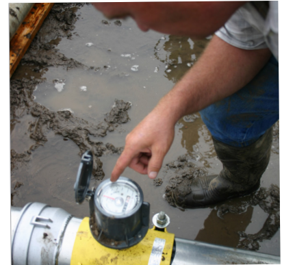
Proper maintenance is critical to ensure that flow meters accurately measure groundwater withdrawal.

The district is in the mandatory reporting phase of the Groundwater Management Area Rules and Regulations. Proper maintenance is critical to insuring that flow meters accurately measure groundwater withdrawal. Without regular maintenance, flow meters will begin to provide inaccurate data and eventually fail. Routine flow meter inspection and maintenance is required for all irrigation flow meters in the district.