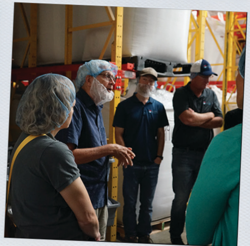
Touring The Grain Place