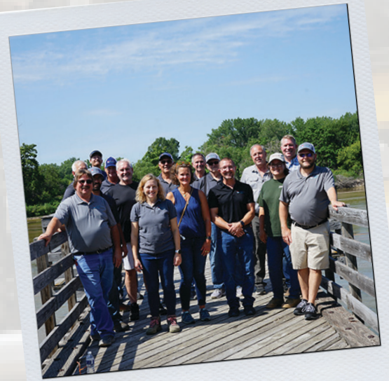
Dark Island Trail

Locations visited on the tour included the Bremer Community Center in Aurora; ethanol plant KAAPA Partners Aurora; The Grain Place; the Whitney Education Center at Gjerloff Prairie (Prairie Plains Resource Institute); and locations on the Dark Island Trail. ♦♦♦