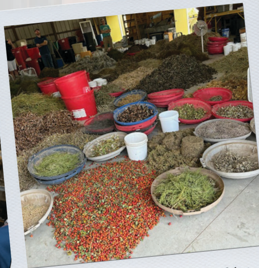
Seed Storage at Prairie Plains