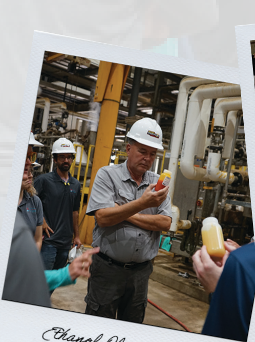
Ethanol Plant Tour-- KAAPA Partners Aurora